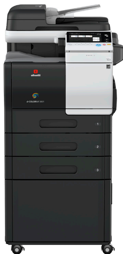
Configuration with 2 optional Paper Drawers and Copy Desk