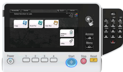
Innovative 7" Multi-touch Display Panel with NFC authentication area and optional Keypad (KP-101)